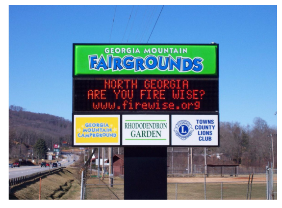
Use of local signs for wildland fire awareness messaging.