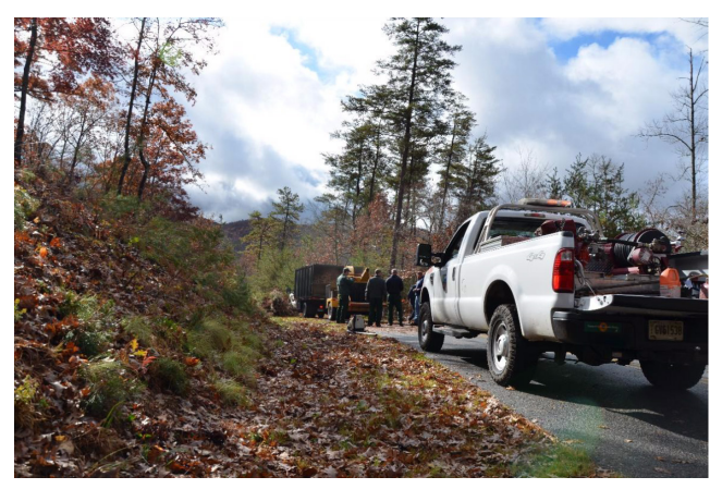
Ashland Cove Firewise Community chipper day, 2013.

Towns County has become a model for other communities to pattern their Fire Adapted Communities program after in order to assure that their county has the best plans and procedures in place to help protect their lives, their homes, and their businesses from a major wildfire event.