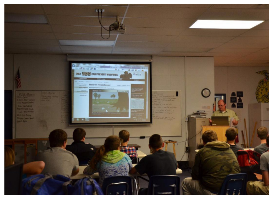
Community presentation to Towns County residents.